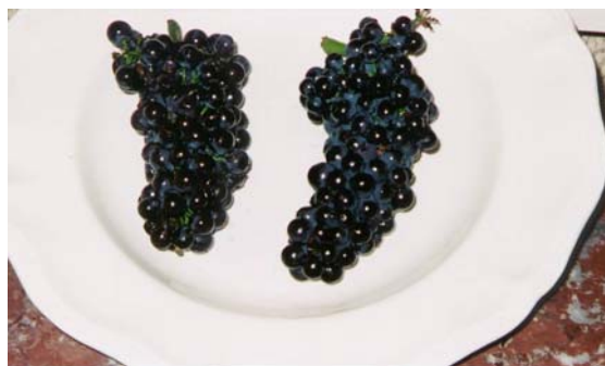
Henri's Perfect Millerandage Grapes

Very satisfied, as all of my growers are, we will see some exceptional wines in 2001. Quantity and quality are well matched for the ultimate superstars and new coming star vignerons ! I cannot wait to taste the wine in the Spring!